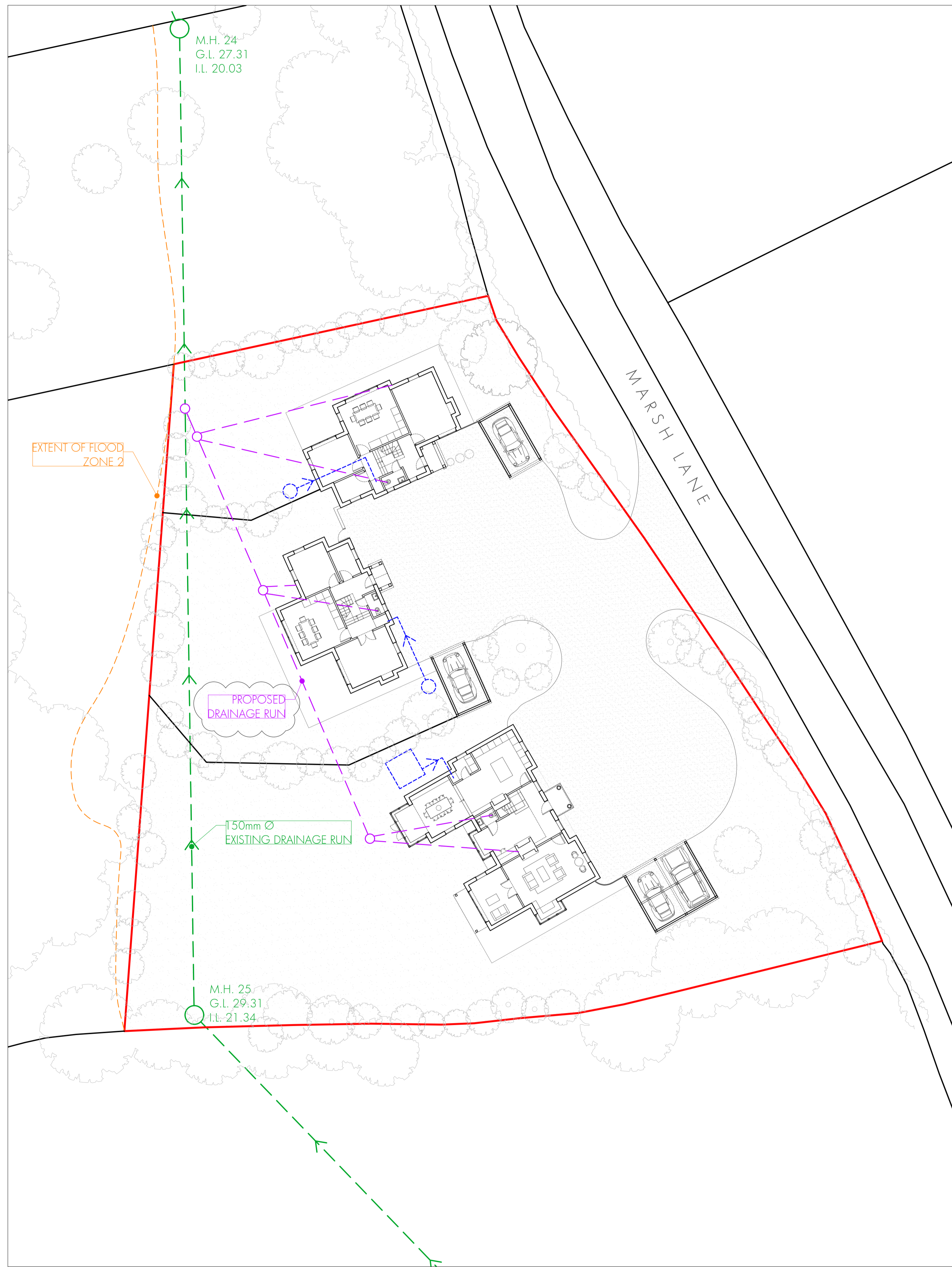
SITE PLAN - 1/200

NOTES: This drawing should not be scaled. The contractor is to verify all dimensions and conditions on site and report any discrepancies to the Architect immediately. This drawing is to be read in conjunction with all relevant documents and drawings Copyright: Neil Tomlinson Architects 2019 www.ntarc.co.uk